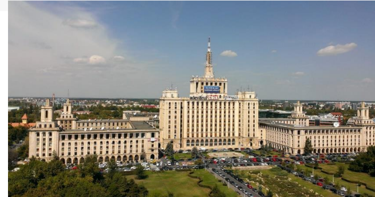
House of the Free Press