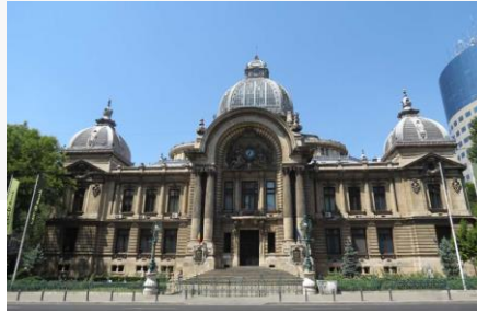
5. CEC Palace