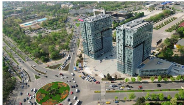
City Gate Towers